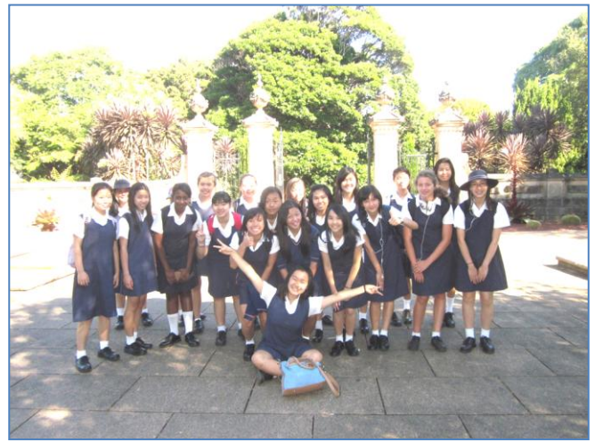
Outside The Royal Botanic Gardens Entrance

At the Susannah Place Museum we looked at the homes of people from the 1900's. We learnt about their way of living and had an opportunity to explore their domestic kitchens and living quarters. Our day came to an end and it was time go home.