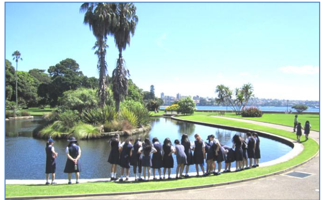
Looking for eels and fish in The Royal Botanic Gardens